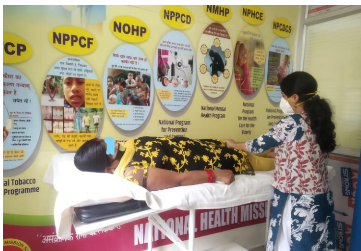
Pain relief & palliative care clinic at UPHC, Ambikapur