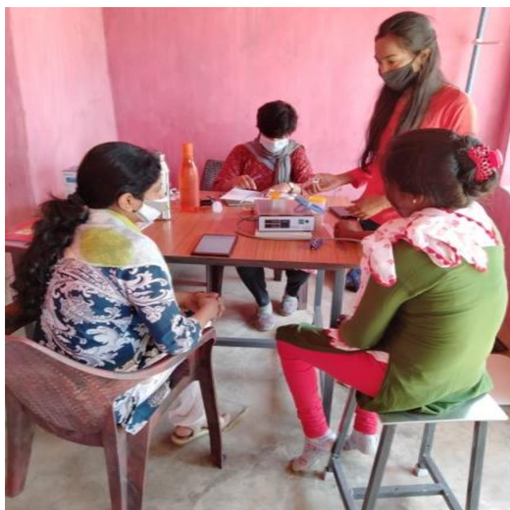
Patient consultation in Biniya Clinic