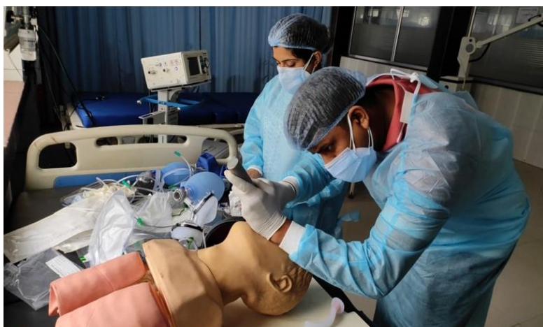
Hands-on practice workshop for MO and physicians – during the second wave of COVID-19