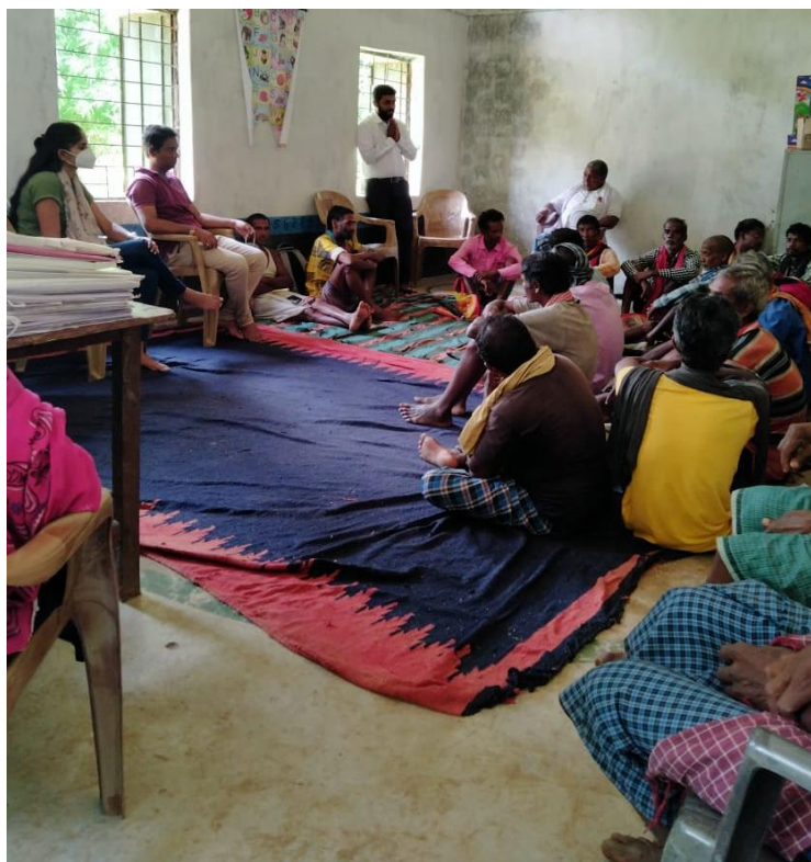
Gram sabha meeting to get consent of community for programme activities

The community health programme is being developed first in 30 villages around Biniya clinic. Meetings were conducted with villagers, sarpanch and other panchayat raj institution members and mitanins (community health workers) to understand local health problems and provide information about the community health programme of Sangwari.