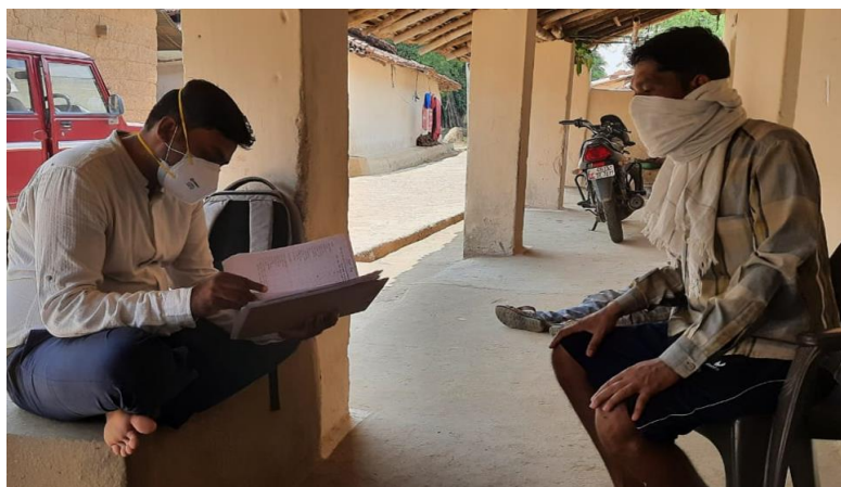
Field monitoring to ensure quality survey